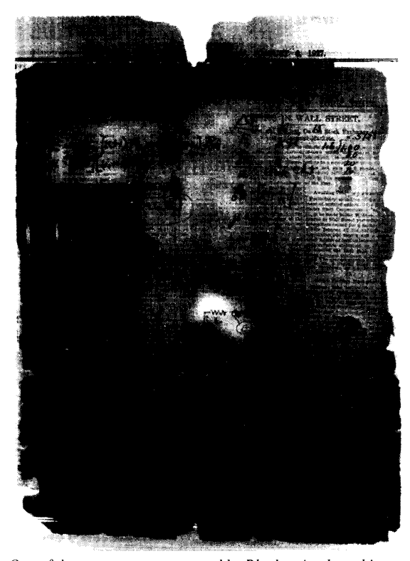
One of the newspaper pages used by Black to jot down his. early ideas on feedback.

Negative feedback became widespread [2]. It allowed the Bell system to reduce overcrowding of lines and extend its long-distance network by