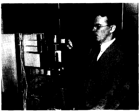
Harold S. Black in 1941 with some of the amplifying equipment that used his idea for reducing distortion by reversing some of the amplifier's output and feeding it back into the input.

Although not based on negative feedback, this amplifier was an essential step to its invention because Black had reformulated the problem. He was no longer trying to prevent vacuum tubes from causing distortion. He accepted that distortion and