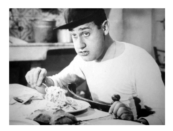
Figure IV. A satisfied reader of this paper.